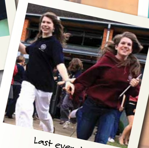
Last ever day