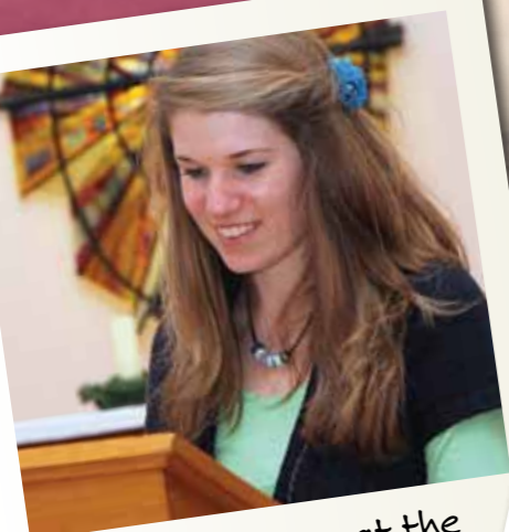
Reading lesson at the carol service