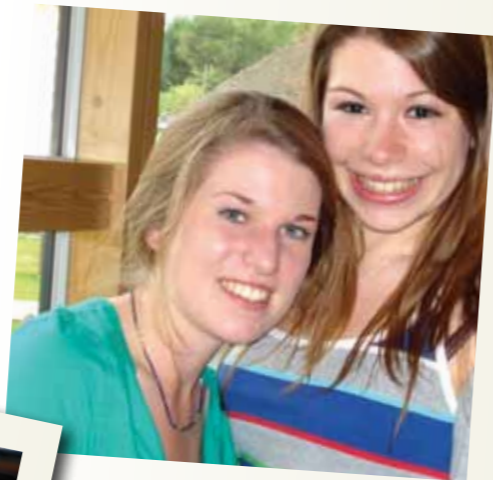
Smiles on results day

"From the moment I walked through the large oak doors as a new member of Year 9, I was immediately aware of just how privileged I was to have been awarded a bursary at St Helen's. For anyone else, the move from the state to the private sector part way through the academic year might seem rather daunting, but I found the transition very smooth – my new class and teachers were very welcoming and I soon felt as though I had always been a member of St Helen's. What awaited me was a unique experience; St Helen's has it all, from the high standard of education, to quirky traditions such as St Kate's Day and I enjoyed every minute of my time there. During my first few weeks as a Helkat I bounced through school with eyes like saucers, marvelling at the outdoor swimming pool, the orchard, the listed buildings, and still couldn't quite believe that this was to be my school for the next four years.