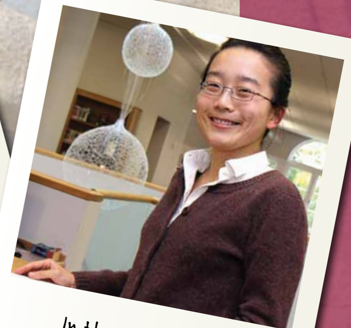
In the new library