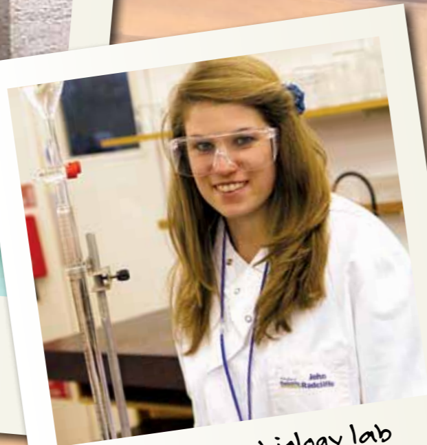
In the microbiology lab