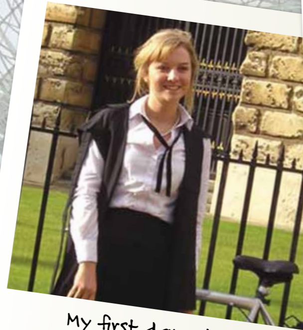
My first day at Lincoln College Oxford.