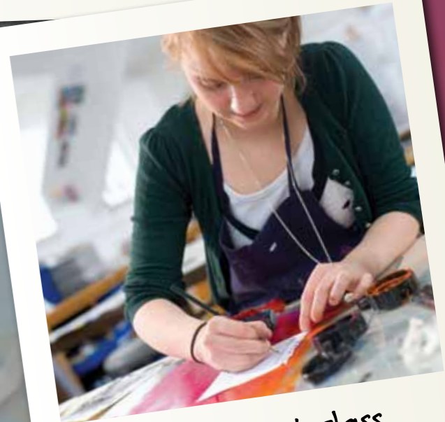
Enjoying an art class while at St Helen's.