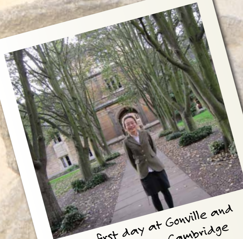
My first day at Gonville and Caius College, Cambridge