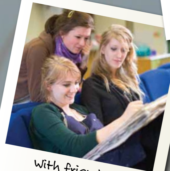
With friends at St Helen's